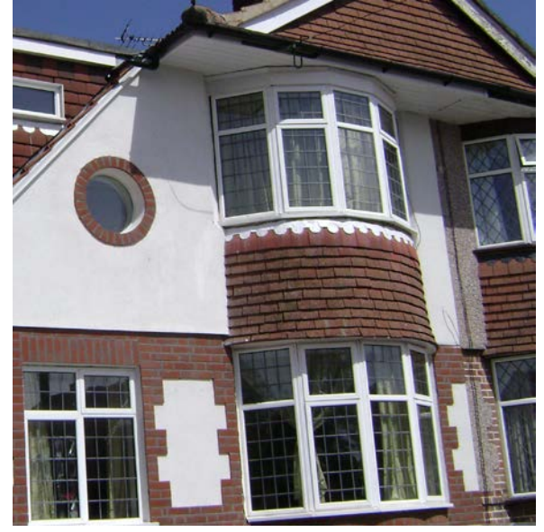
This is an example of an insulated Watford property that used a combination of smooth render with a brick finish.

* The Energy Savings Trust estimates typical savings for a semi-detached property of £225 per year from your heating bills and savings of 930 kg of Carbon dioxide every year.