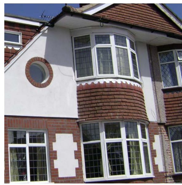
This is an example of an insulated Watford property that used a combination of smooth render with a brick finish.

* The Energy Savings Trust estimates typical savings for a semi-detached property of £225 per year from your heating bills and savings of 930 kg of Carbon dioxide every year.