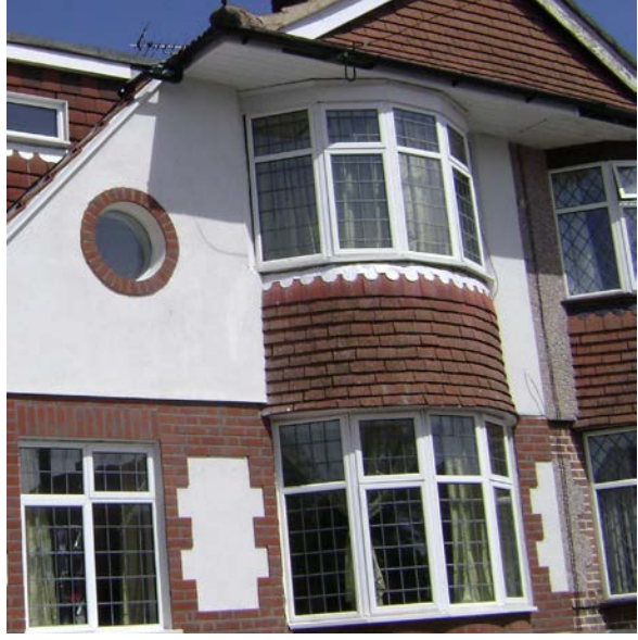
This is an example of an insulated Watford property that used a combination of smooth render with a brick finish.

* The Energy Savings Trust estimates typical savings for a semi-detached property of £225 per year from your heating bills and savings of 930 kg of Carbon dioxide every year.