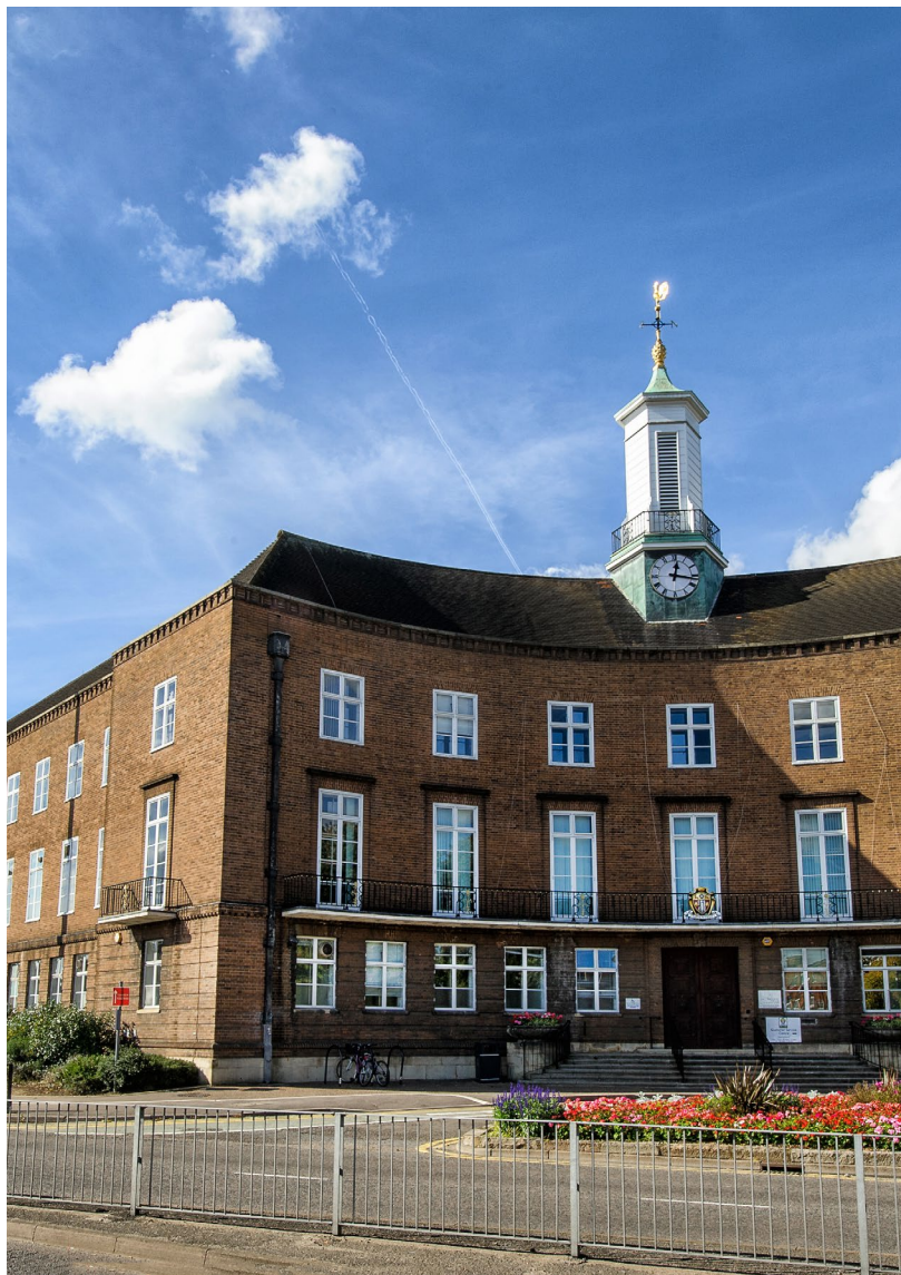
Watford Town Hall