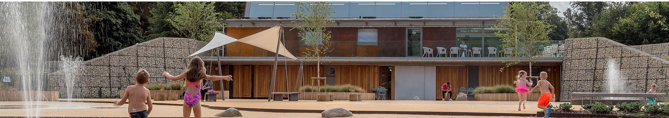
Cassiobury Park Hub © Knox Bhavan Architects for Watford Borough Council Building Futures Award 2018

Large projects, for example schemes with several development plots, may be split into smaller elements, to ensure that each component receives adequate time for discussion.