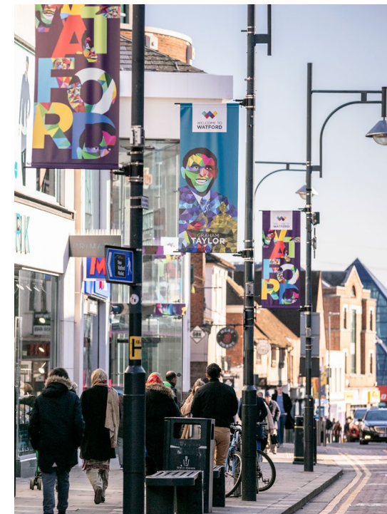
Watford High Street

process, in line with Section 12 of the NPPF. This states that: 'Local planning authorities should ensure that they have access to... design advice and review arrangements... These are of most benefit if used as early as possible in the evolution of schemes, and are particularly important for significant projects such as large scale housing and mixed use developments.' (Para. 133, NPPF, 2021).