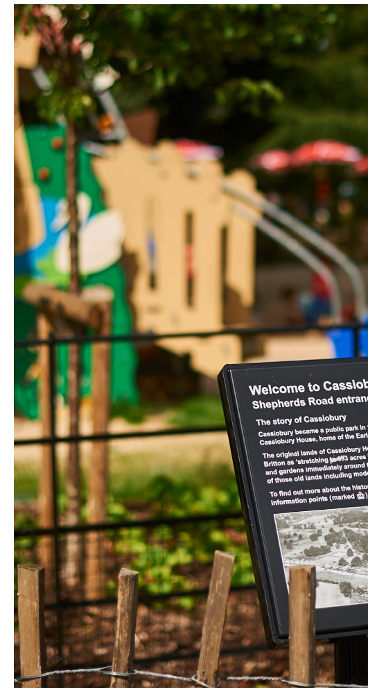
Cassiobury Park

A typical chair's review will last 60 minutes: 10 minutes introductions and briefing by planning officers; 15 minutes presentation; 35 minutes discussion and summing up by the chair.