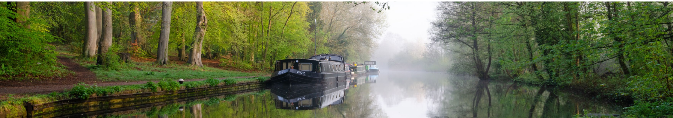
Cassiobury Park

Design Review: Principles and Practice Design Council CABE / Landscape Institute / RTPi / RIBA (2013)