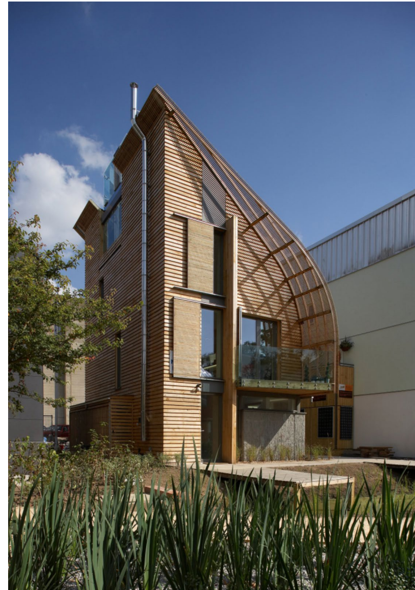
Lighthouse 2008 British Homes Award, 2008 RICS South East Award

From time to time, it may be of benefit for specialist advice to be provided beyond the Place Shaping Panel membership. In such cases, a professional with the relevant expertise may be invited to attend a review meeting, participating in the discussion with the status of an adviser to the panel.