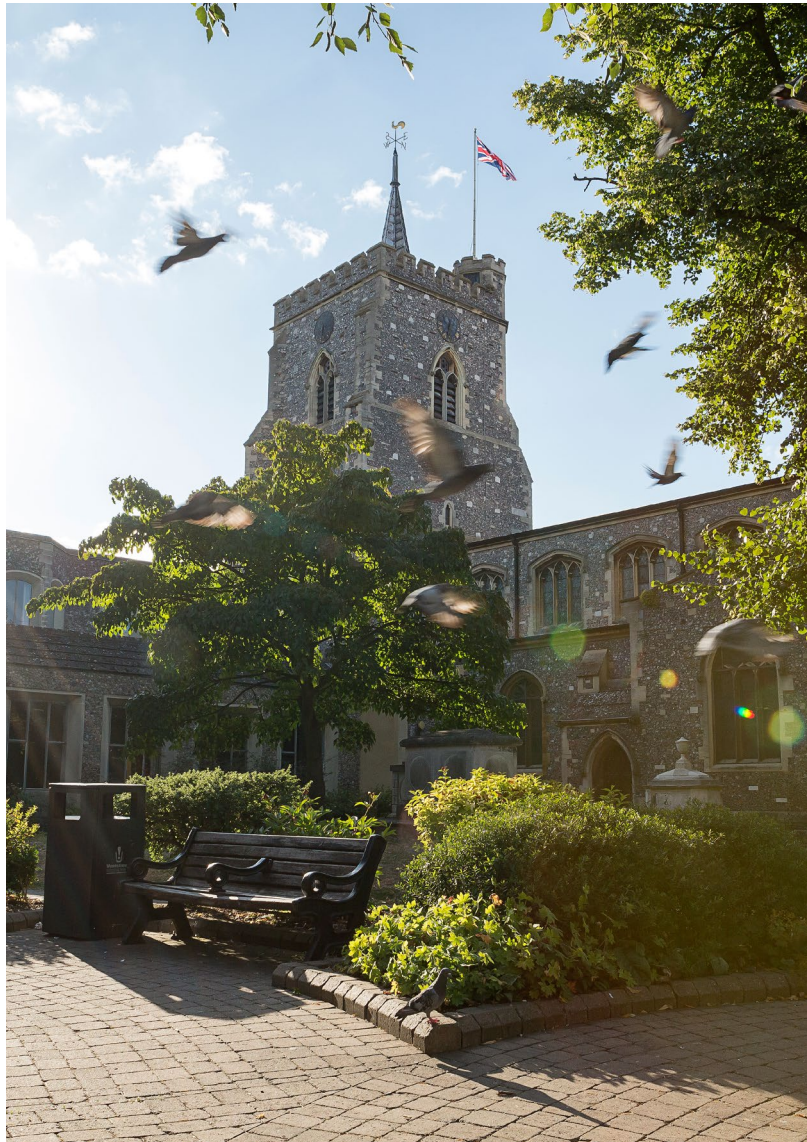
St Mary's Church, Watford