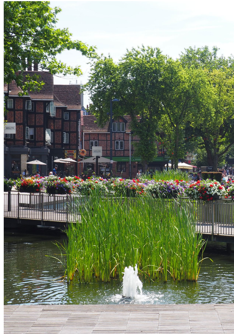
Watford High Street