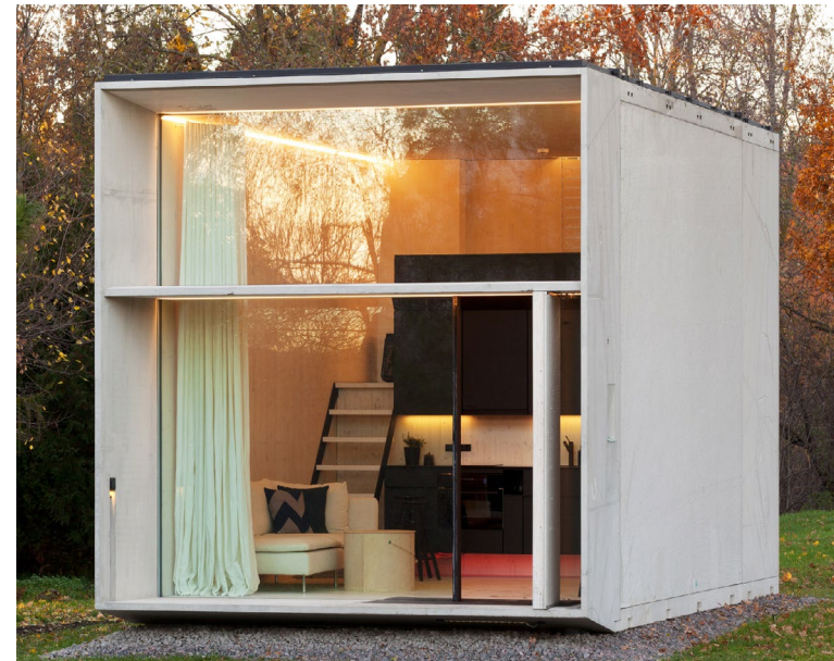
The Koda House, BRE Innovation Park, Watford

As part of this annual review process, a meeting will be held with key Watford Borough Council officers and the panel chair to discuss the report and consider any recommendations for the following year.