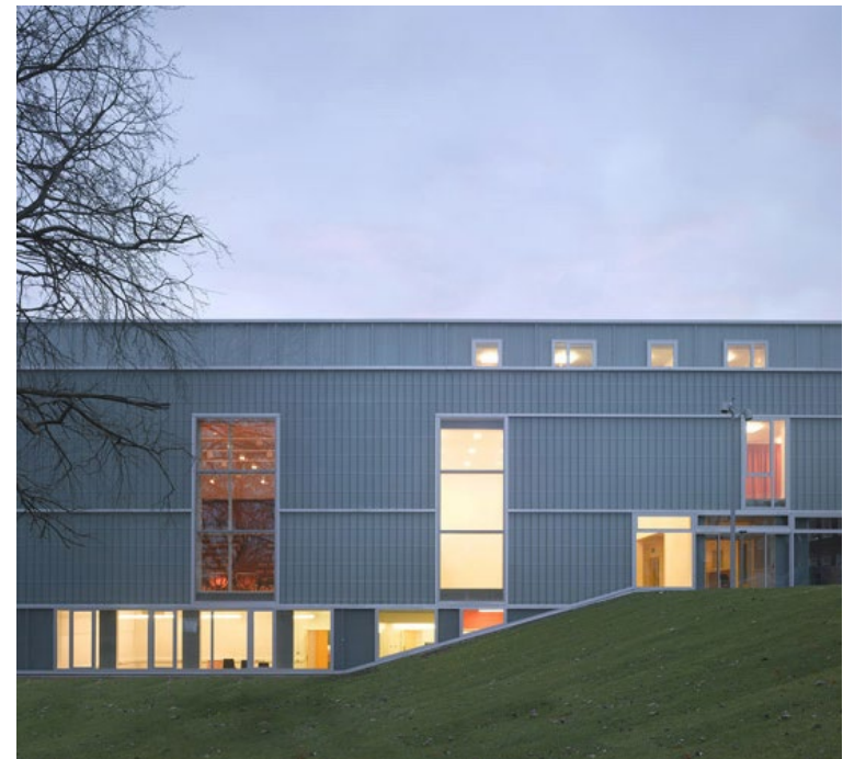
Watford Music Centre, Tim Ronalds Architects

As a public authority, the Watford Borough Council is subject to the Freedom of Information Act 2000 (the Act). All requests made to Watford Borough Council for information with regard to the Place Shaping Panel will be handled according to the provisions of the Act. Legal advice may be required on a case by case basis to establish whether any exemptions apply under the Act.