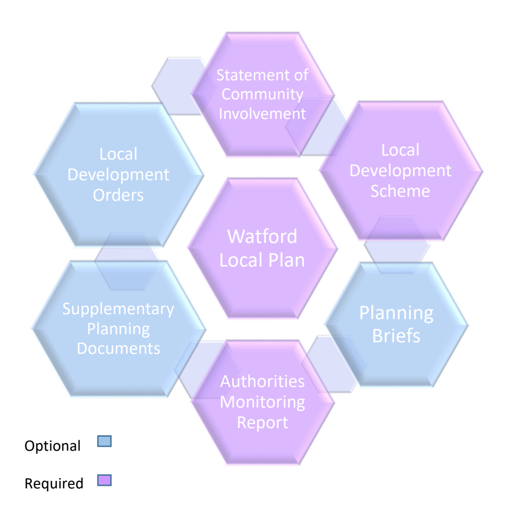
Figure 1: Planning Policy Documents

As shown in Figure 1, the local authority is required to produce a Local Plan. The Local Plan consists of statutory Local Plan documents and optional Local Plan documents (formally referred to as local development documents). These documents consist of: