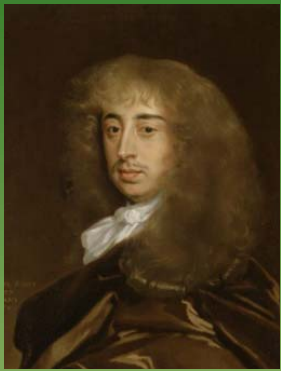
Arthur Capel 1st Earl of Essex © watford museum

Cassiobury became a public park in 1909. Before that it was part of the lands of Cassiobury House, home of the Earls of Essex for over 300 years.